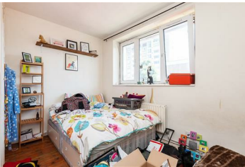
9'0" x 11'10" (2.75 x 3.62)